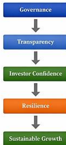
Figure 2: Governance as a Pathway to Sustainable Growth